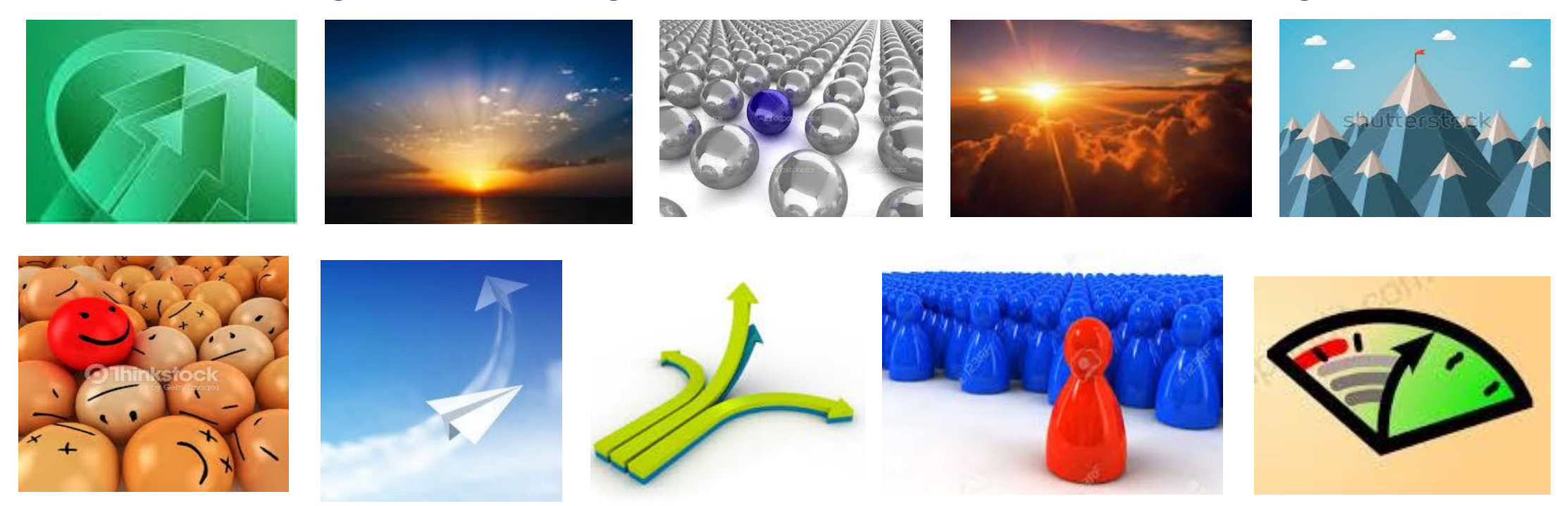
Why? While each image suggests differentiation, which is an acceptable part of your marketing message, there is no explicit MQ placement reference or implied endorsement.

Examples of general images allowed in lieu of the MQ graphic: