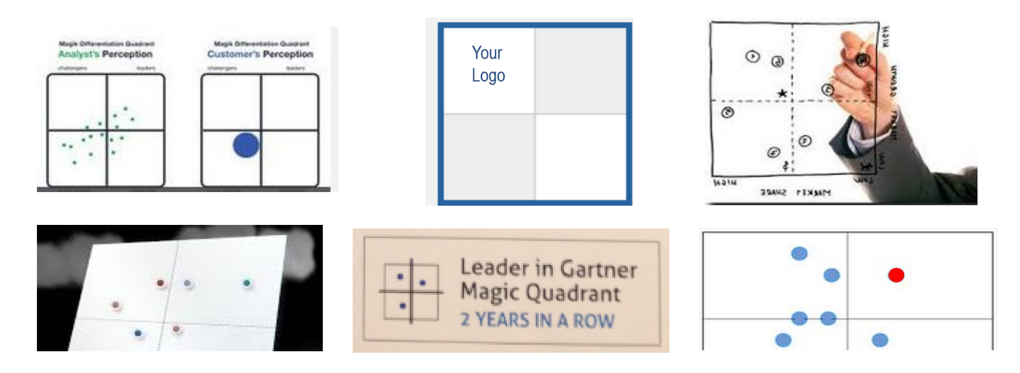
Why? Each image focuses in on the specific vendor's placement and calls into question Gartner's objectivity and independence.

More examples of what we <u>do not</u> allow: